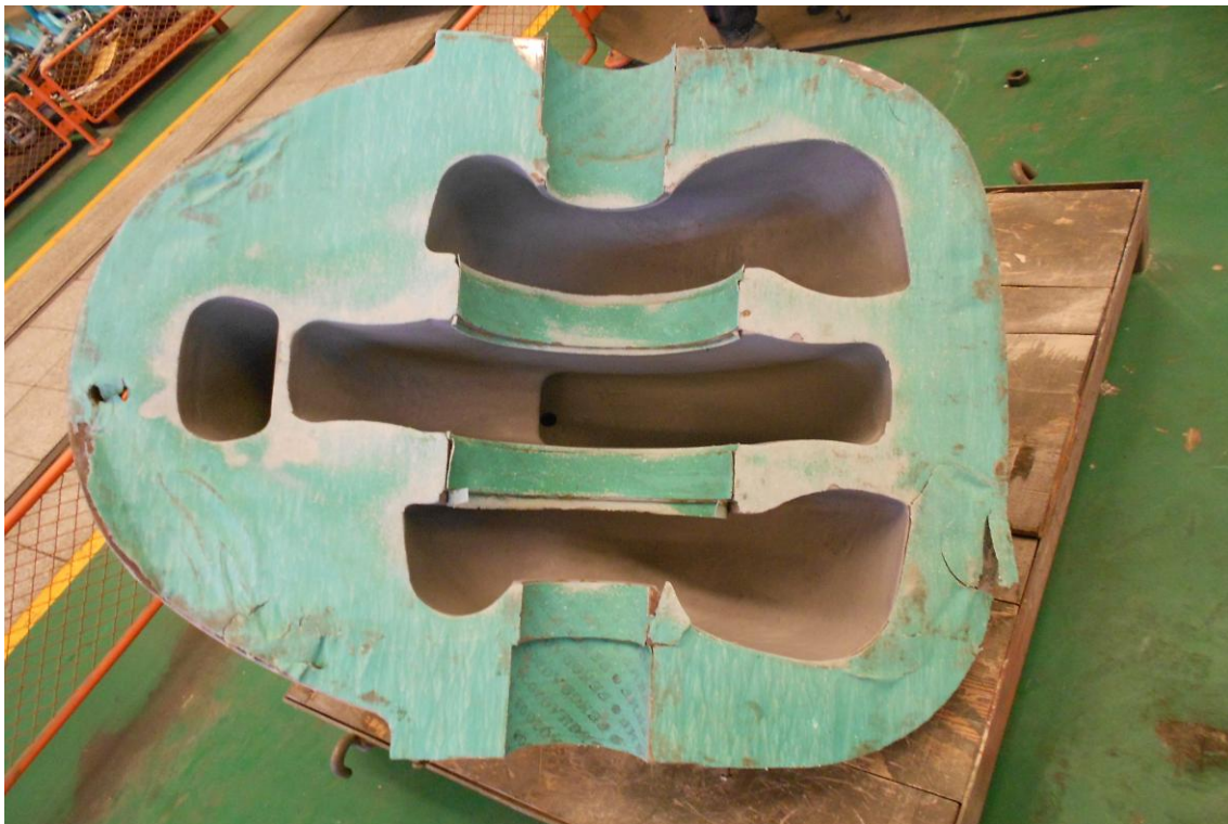
Shell/impeller/end cover is ready for coating by sand blasting